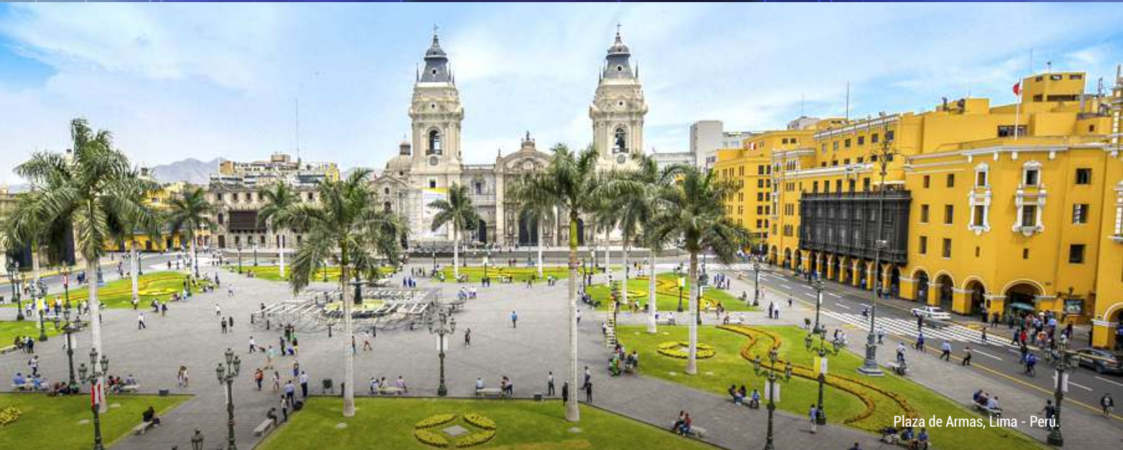
Plaza de Armas, Lima - Perú.